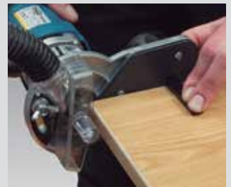
Precise guiding for corner trimming.