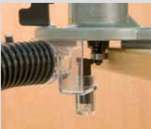
Adjustable vacuum connection equipped with a bearing brake to prevent leaving marks on the edge.