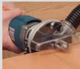
V3 round head included with the set.

V3 round head included with the set. Very practical for trimming with support on edges and essential for jobs that require this type of work.