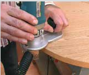
Very easy trimming of either straight or shaped pieces.