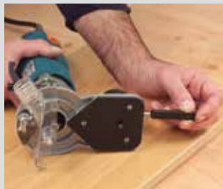
Corner trimming device easy to prepare and to use. When not in use it can be hidden into the base.