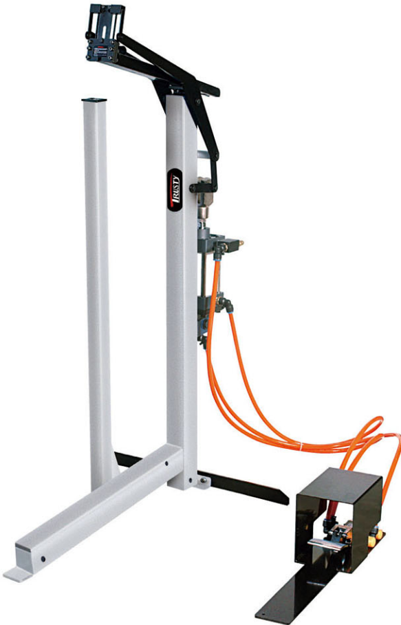
type A, type C carton staples