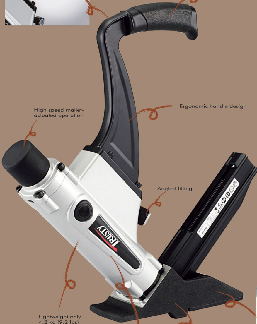
High speed mallet-actuated operation