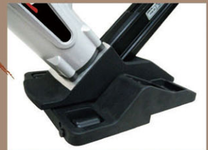
Foot kit in quick move