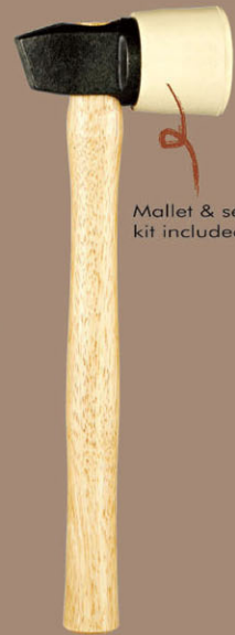
Mallet & service kit included