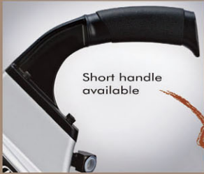
Short handle available